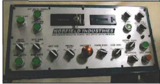
Standard 5000 Control Panel