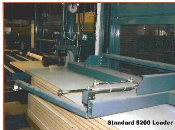
Standard 5200 Loader